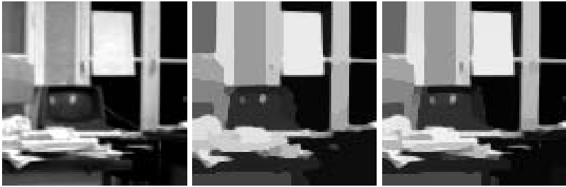
Fig. 3. Left: Original image, 93 \times 93 pixels. Middle: Balanced forward–backward diffusion with standard explicit scheme, \varepsilon = 0.1 , \tau = 0.0025 , 160000 iterations. Right: 2 \times 2 -pixel scheme (20), \tau = 0.1 , 4000 iterations

diffusivity, a high number of iterations is needed for reasonable \varepsilon . It can be seen that the 2 \times 2 -pixel scheme and the unregularised TV diffusivity which cannot be used in the explicit scheme considerably reduce blurring effects caused by the discretisation.