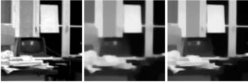
Fig. 1. Left: Original image, 93 \times 93 pixels. Middle: TV diffusion with standard explicit scheme, where TV diffusivity is regularised with \varepsilon = 0.01 , \tau = 0.0025 , 10000 iterations. Right: TV diffusion with 2 \times 2 -pixel scheme (20) without regularisation of diffusivity, \tau = 0.1 , 250 iterations